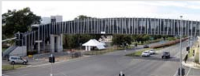
Yaamba Road Pedestrian Overpass

Adding to this the project has now claimed one of the top honours in the Australian Institute of Architects' 2011 Central Queensland Regional Architecture Awards.