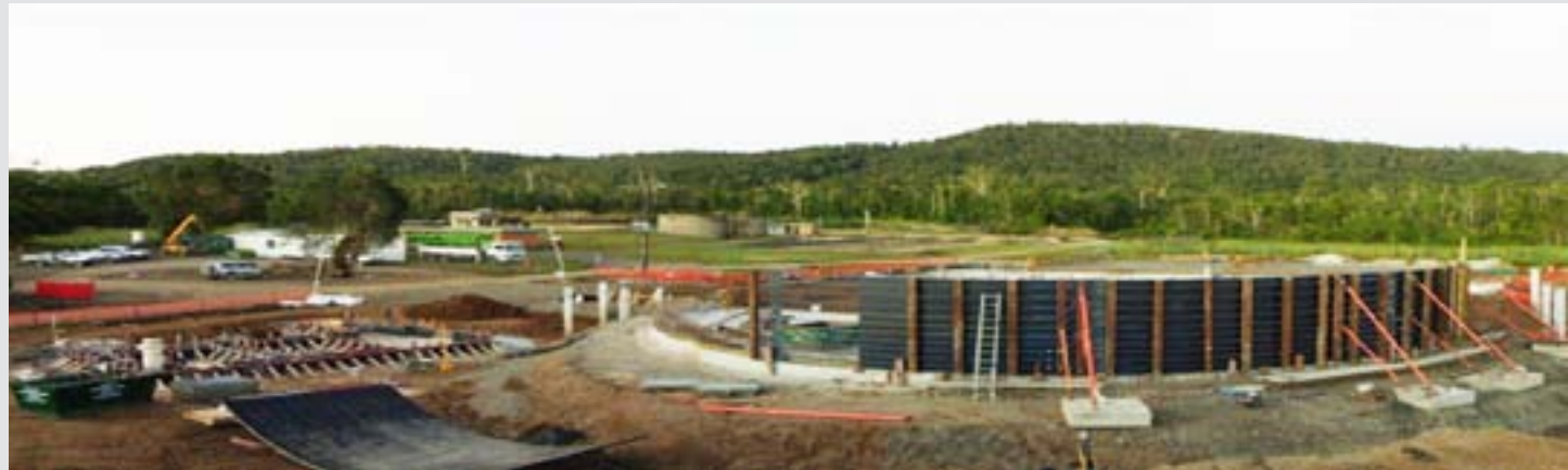
Innisfail Waste Water Treatment Plant

The projects involve site services and civil works in support of the expanding mine sites. The projects are part of a $5 billion expansion of metallurgical coal projects in the Bowen Basin.