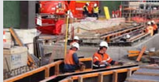
Work nears completion on York Civil's ACR City West Substation Project

Keeping you informed and updated on the new and exciting infrastructure projects and initiatives at York Civil.