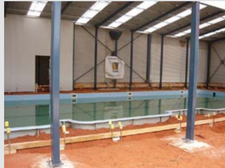
The new rehabilitation pool for Roxby Council

T: (08) 8671 2773 F: (08) 8671 3030 E: info@yorkcivil.com.au